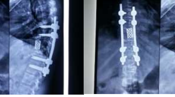
T9 and T10 TB case, which was performed posterior fusion at first and anterior decompression and remove abcess around vertebra