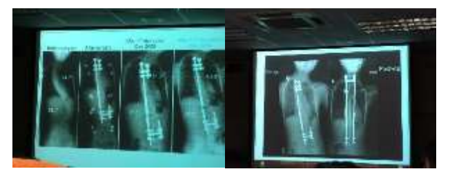
This is one case of using magnetic growing rod system.

PM C6 corpectomy by Prof Luk for C5/6 and C6/7 cervical myelopathy by 2 level bulged disc.