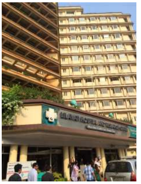
Lilavati Hospital is private hospitals. they has 80% lumbar degenerative disease 20% cervical.

Centre's visited: Lilavati Hospital and MRC and Breach Candy Hospital