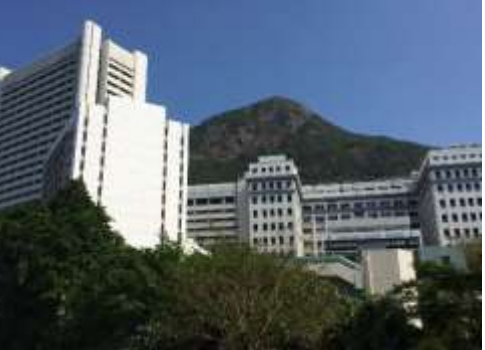
Above; The Duchess of Kent Children's Hospital Below; Queen Mary Hospital