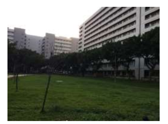
Chung Gung hospitals has 40 Orthopaedic surgeons and 25 residences, more than 80 operation rooms and 10 Orthopaedic rooms. Furthermore this hospital has 2 branch hospitals.

Duration; 17<sup>th</sup> – 24<sup>th</sup> November 2013 Centre's visited: Linkou Chang Gung Memorial Hospital