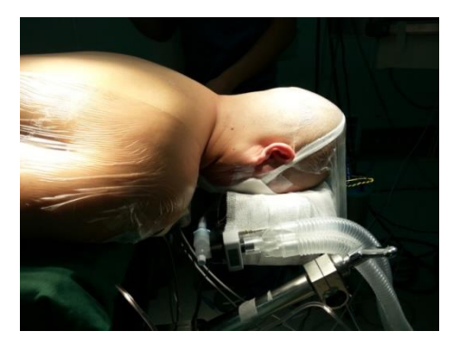
A patient was positioned for posterior cervical surgery. All position was made by using soft band gently. They used double soft horse-shoe type