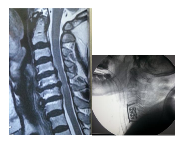
Severe myelopathy and C5 corpectomy was successfully done.