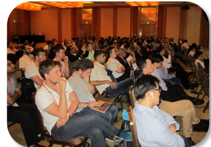
Delegates during the lectures.