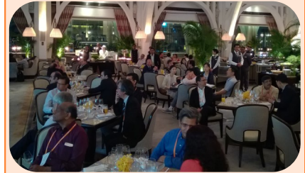
APSS Dinner at Clifford Pier Restaurant, The Fullerton Bay Hotel