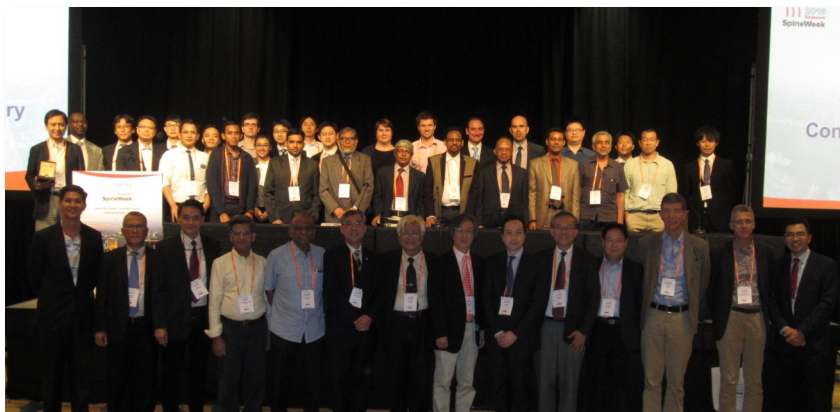
A group photo of delegates and speakers after the closing ceremony on Friday, 20 May.