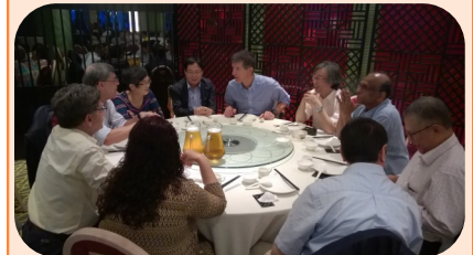
APSS Faculty Dinner at the famous No Signboard Restaurant.