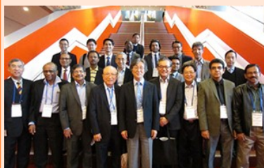
Group photo of faculties at APOA Congress in Melbourne Convention Center.

Many renowned spine surgeons, consisting of experts in the Spine field and young, high potential co-opted members, were invited to take part in the scientific program. The congress provided a tremendous opportunity for all the participants not only to meet with each other and exchange perception but also to gain and share the knowledge and experiences with the guest expertise as well as the international colleagues.