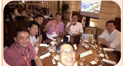
APSS-Singapore Dinner at Empress Restaurant in the Asian Civilization Museum.