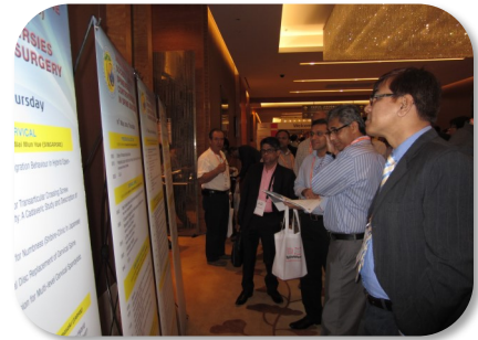
Delegates looking at APSS programs during coffee break.