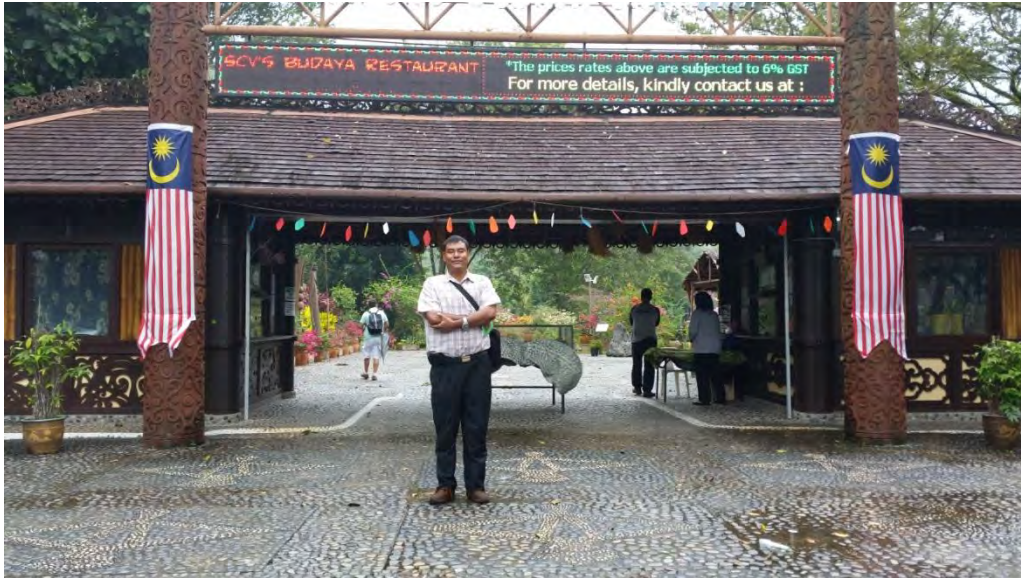
A Visit to Sarawak Cultural Village

After completion of my fellowship at Sarawak General Hospital, I left Kuching by Malaysian Airlines flight on November 15 and reached Kuala Lumpur. I was transferred to my hotel Anjung Penyayang by the arrangement made by APSS.