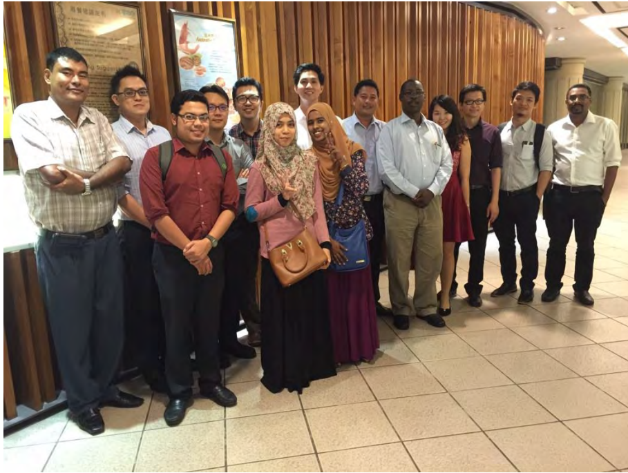
With Spine Team