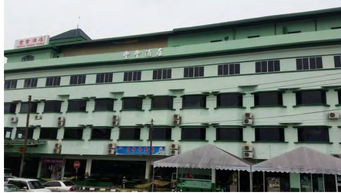
Hotel Hung Hung