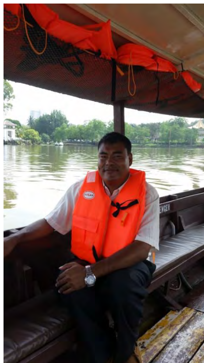
Boat ride in Sarawak River