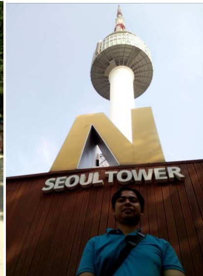
In front of Gyeongbok-gung Palace, with APSS Travelling Fellows and at the North Seoul Tower