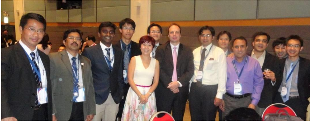
The 2015 APSS Fellows with Depuy Synthes Officials