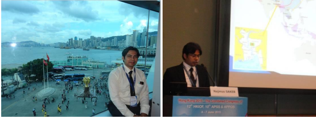
Golden Bauhaniya Square from the conference Hall and my presentation session

The third day of the conference was focused on degenerative spine, paediatric and adult spinal deformity. The presentations were enriched with information regarding surgeries from open to MIS, placing screws from cervical to ilium, and even every sort of degenerative spine problems and deformity issues for paediatric and adults were addressed. At the end of the day the Congress Banquette included handing over the certificates. Professor Kuniyoshi Abumi and Professor Arvind Jayaswal handed over the recognition one by one to all the fellows. Certainly it was a big big day!