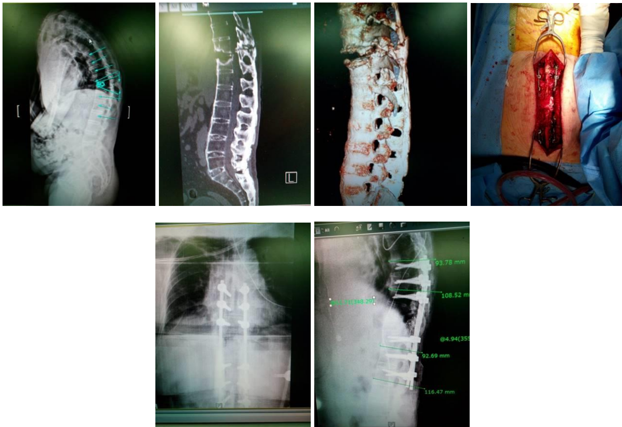
Anderssen Lesion at D10-11 managed by wedge resection and posterior stabilization

The day started with attending the Spine conference in the morning and there was a deliberate presentation and discussion on DSPLT and its management option and goals. After having the breakfast with the unit we straight away went for the Third consecutive theaters where we had three scheduled cases starting with a 75 year old female patient with DSPLT L3 over L4 and L4 over L5 with severe canal stenosis managed by 2 consecutive levels PLIF. The last case of the day was also a DSPLT L4 over L5 with severe canal stenosis and manages similarly with PLIF as well but the Microscopic decompression by Professor LEE was unique to observe. Other than these cases the second case was something unique and trademark of this Hospital; Ankylosing Spondylitis with Andersen lesion at D10/D11. Professor made space and went for wedge resection of the lesion and closing the wedge putting bone grafts in between and posterior fixation from D6 to L2. He is famous for his technical excellence in dealing with spinal osteotomies.