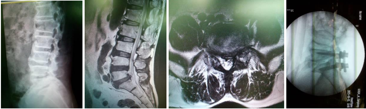
A case with Degenerative Foraminal Stenosis L5/S1 with Right sided Radiculopathy managed by PLIF