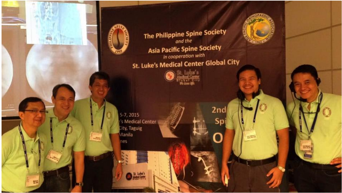
The surgeries all went well without any significant complications.